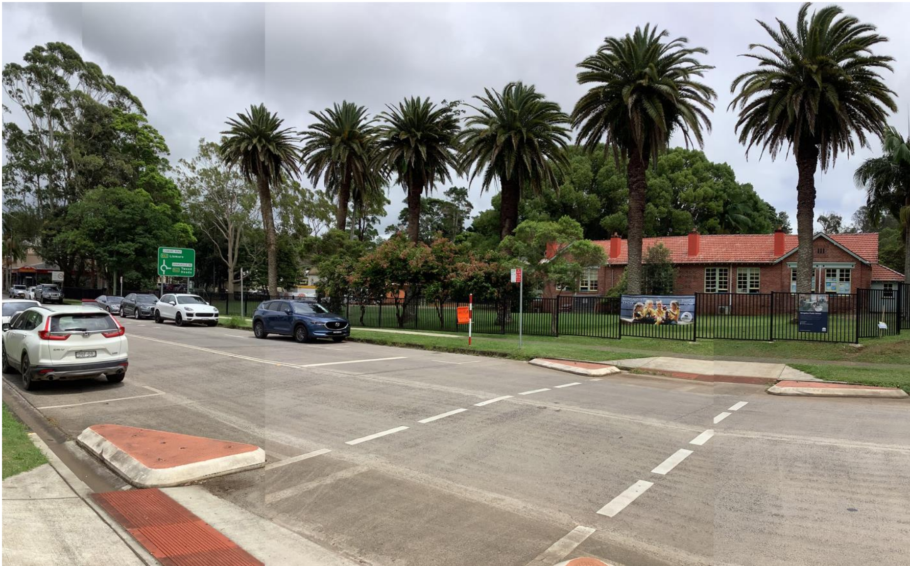
Figure 3: Photomontage Two: Proposed new teaching building. Primary viewshed from Byron Street (Williams Architects, 2021).