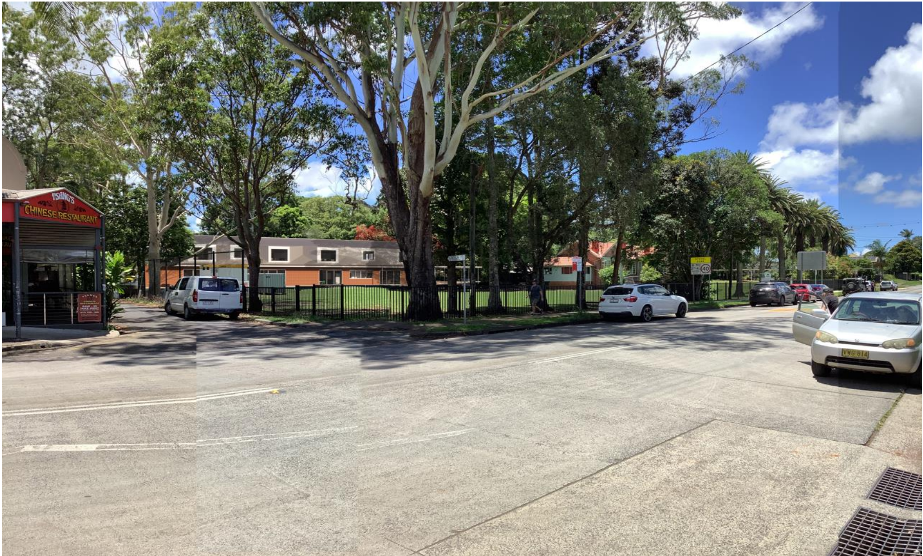
Figure 4: Photomontage Four: Proposed new teaching building. Secondary viewshed from corner of Byron Street and Station Lane (Williams Architects, 2021).