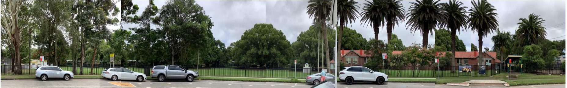
Figure 1: Existing primary view toward Bangalow Public School from Byron Street (noting the 1925 Building to the right of the image) (FKG, 2021).