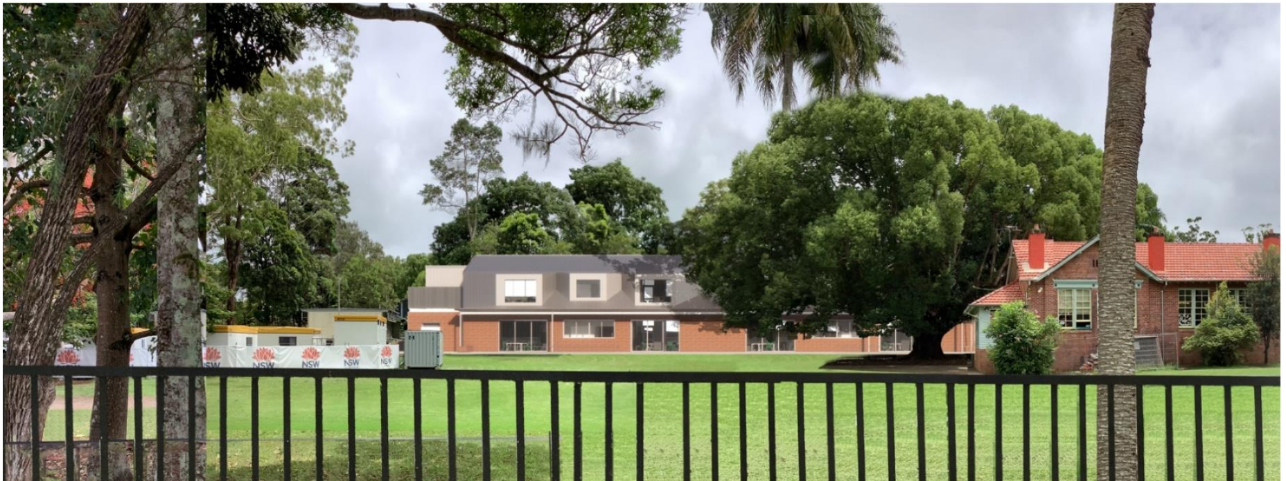
Figure 2: Photomontage One: Proposed new teaching building in relation to 1925 building. Primary view from Byron Street (Williams Architects, 2021).