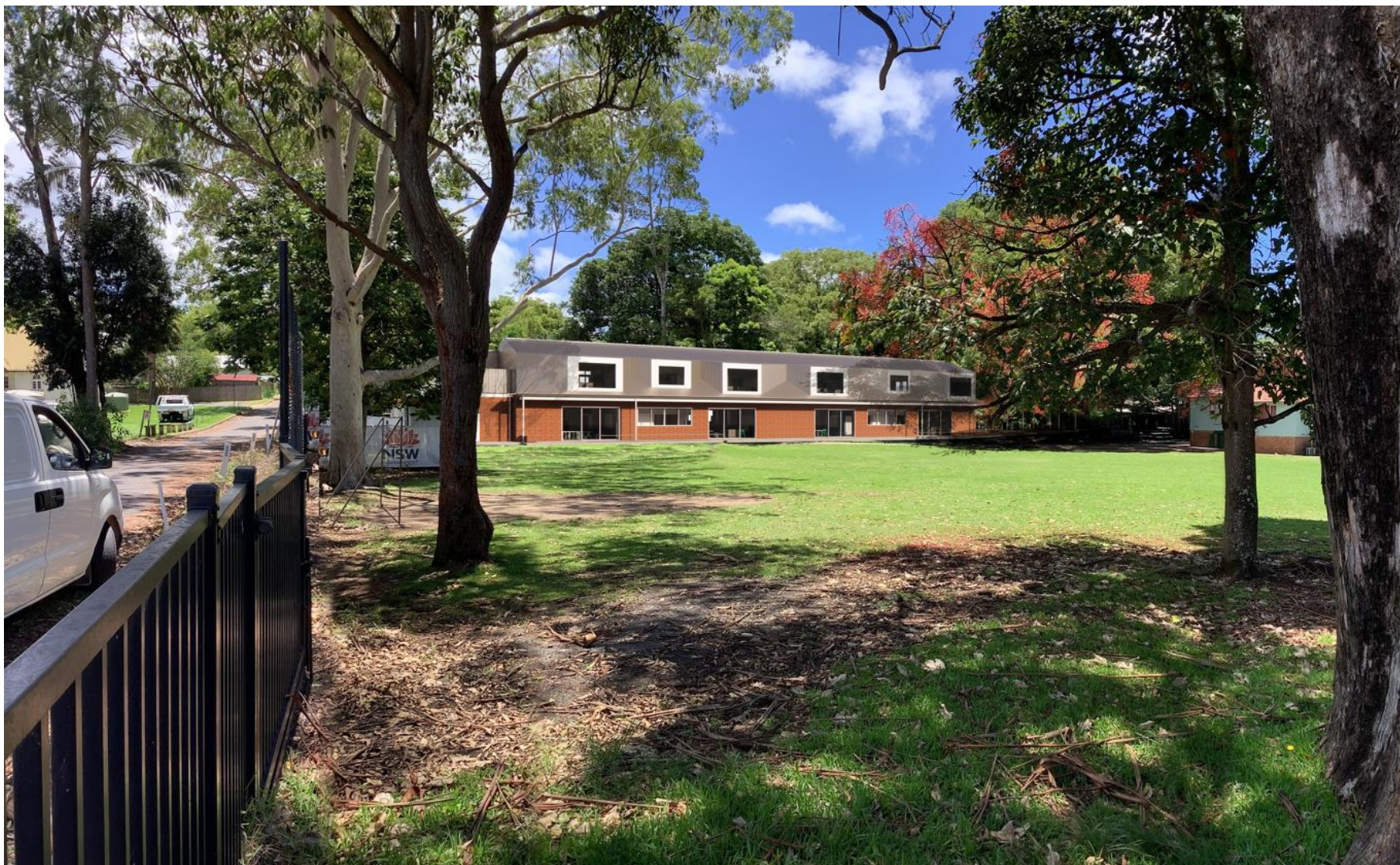
Figure 5: Photomontage Four showing proposed new teaching building. Secondary viewshed from corner of Byron Street and Station Lane (Williams Architects, 2021).